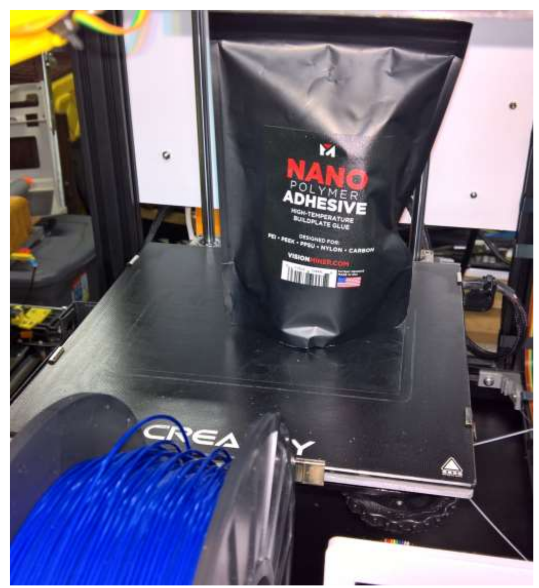
Metal bed clips in place